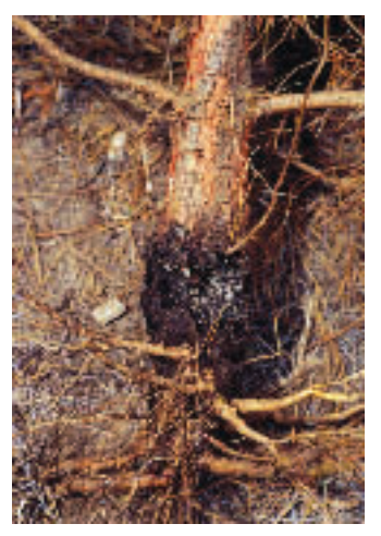
Figure 6. Infected root collar soaked with resin. Courtesy of Steven Katovich, USDA Forest Service, Bugwood.org (#1199001)