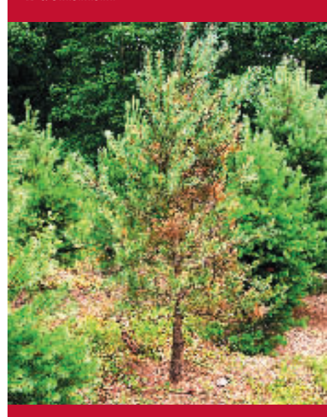
Dying tree with pine root collar weevil infestation.