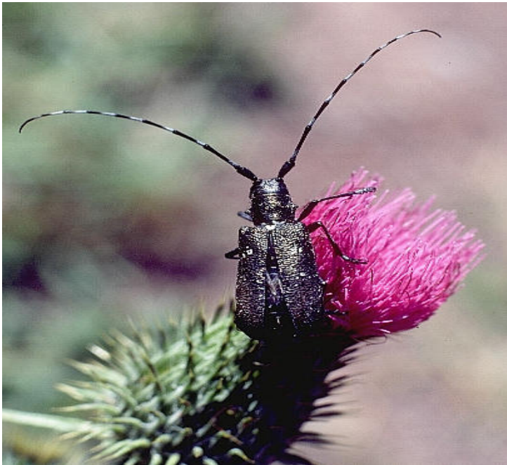
White-spotted Sawyer.

Pinewood nematodes are carried from tree to tree by beetles, principally sawyer beetles ( Monochamus sp.). Other beetles may vector PWN for short distances but sawyers are the main culprits. Based on a survey of the Entomology museum at MSU, Michigan is home to at least 5 species of Monochamus with M. scutellatus (the white spotted sawyer) apparently the most common based solely on the number of specimens in the collection. Sawyer beetles are very skittish in their behaviors and the adults are not often seen.