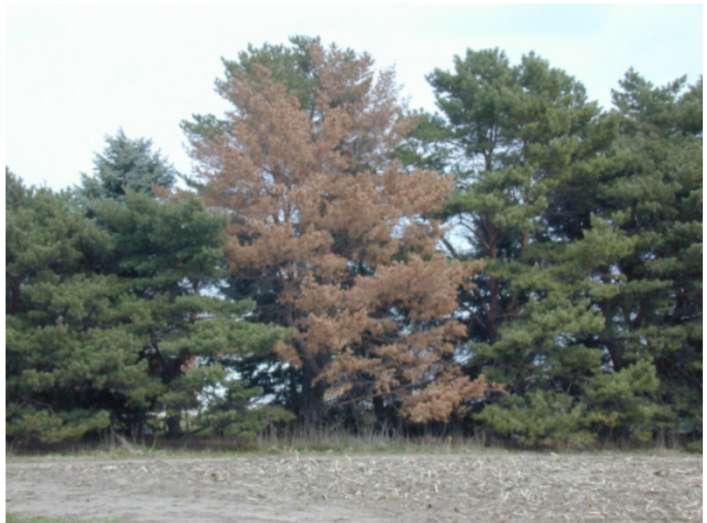
Infected Scotch Pine tree.

PWN is a plant-parasitic nematode but in comparison with other nematodes of this type, it is unusual because it is a parasite of the aboveground parts of the tree, is carried by an insect and does not enter the soil. The majority of plant-parasitic nematodes invade roots. However, PWN, like all other plant-parasitic nematodes, is microscopic. Nematodes are small animals and are capable of locomotion. Due to its ability to rapidly move through plant tissue, it is difficult for pine trees to defend. See below for more information regarding its success as a pathogen.