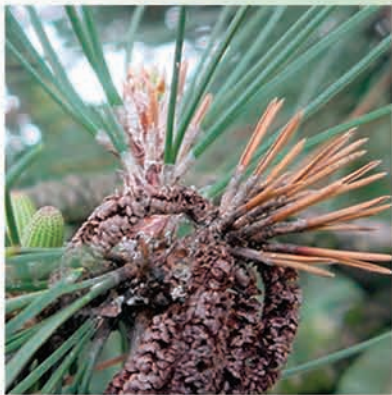
Diplodia Tip Blight on Pine