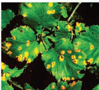
Cedar Hawthorn Rust

• After the long Michigan winter, you are probably looking forward to the longer days, warmer temperatures, blooms and the sight of robins that herald the return of spring.