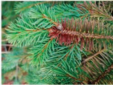
Needle Cast on Spruce

A pple scab, needle cast, tip blight, rusts, anthracnose, tar spot; these are some of the terms that you may have heard being mentioned about the trees and shrubs in your landscape.