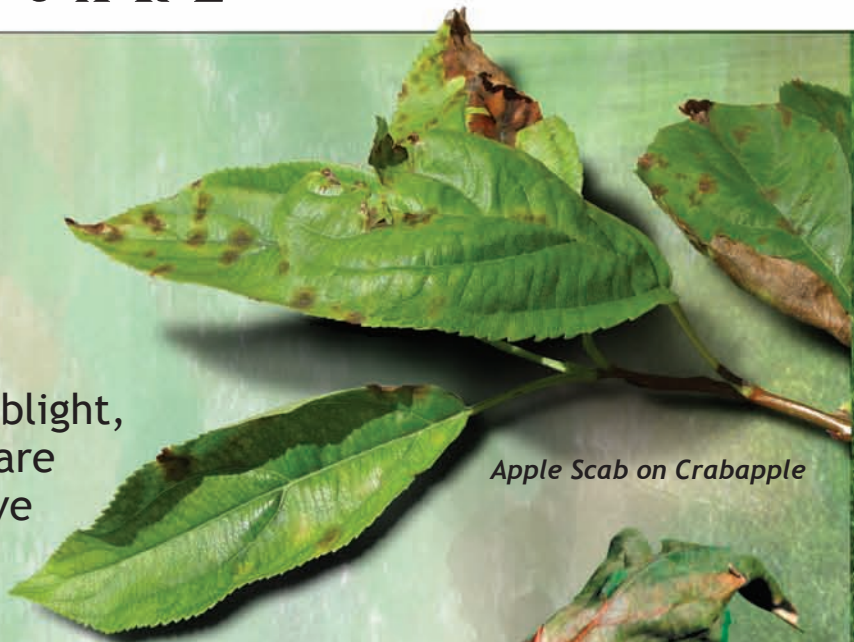
Apple Scab on Crabapple

• Timing of treatment applications is critical. Prevention requires good timing and overlapping applications for best results!