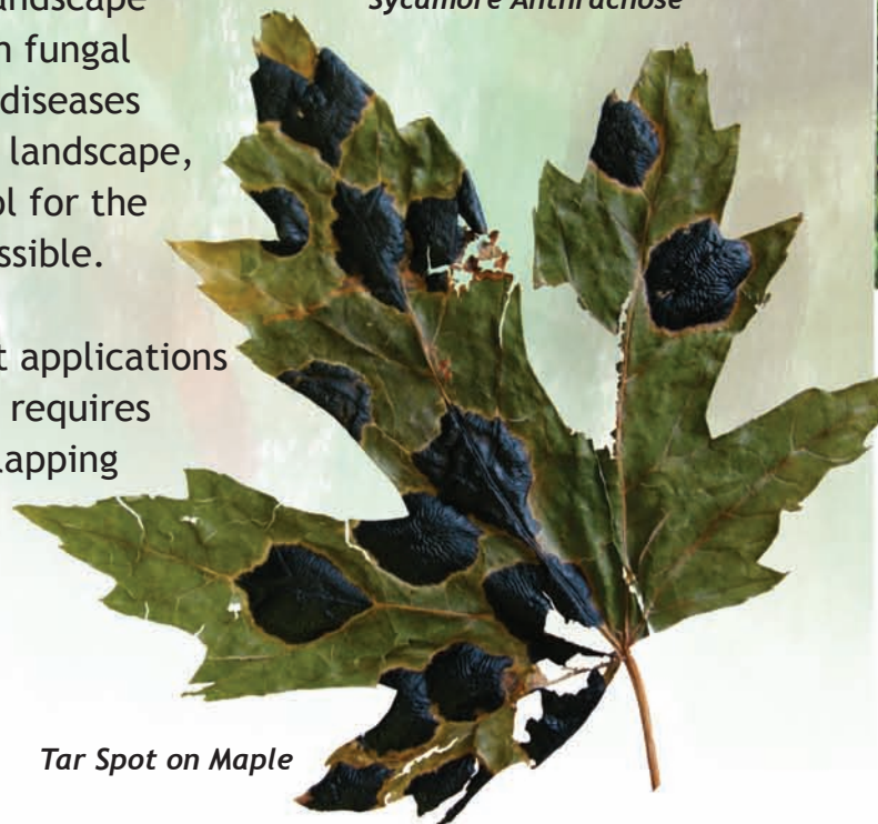
Tar Spot on Maple