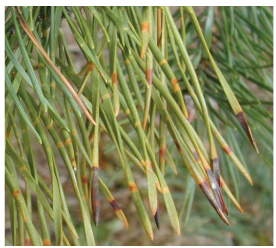
Figure 1. In the fall, early symptoms of Dothistroma needle blight appear as spots or bands on the needles that may have a water-soaked edge.