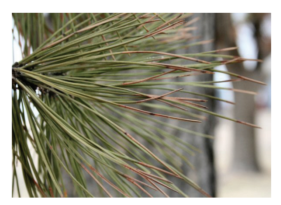
Figure 2. As the symptoms of Dothistroma needle blight progress, the tips of the needles may turn reddish brown while the needle bases remain green.