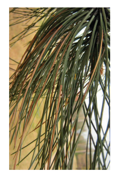
Figure 4.The browning of needle tips killed by Dothistroma is variable. Some needles are killed nearly to the base while others are less affected or unaffected.