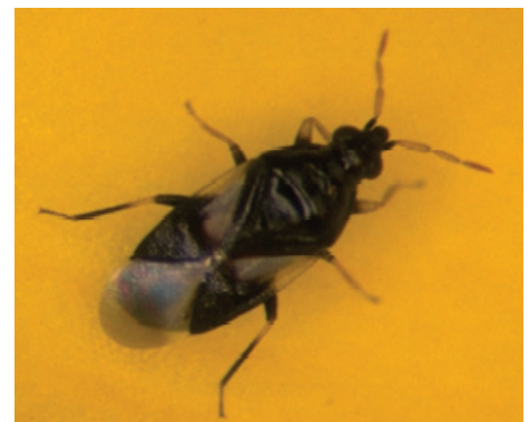
Figure 5: Minute pirate bug.