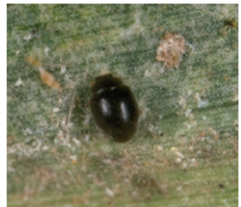
Figure 4: "Spider mite destroyer" lady beetle.