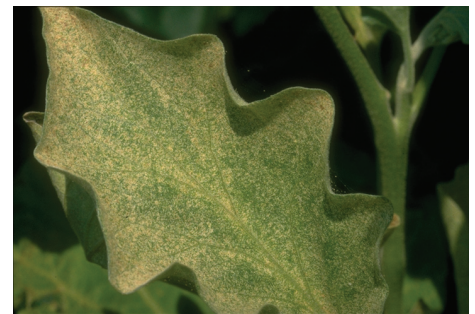
Figure 3: Twospotted spider mite injury to eggplant.

Various insects and predatory mites feed on spider mites and provide a high level of natural control. One group of small, dark-colored lady beetles known as the "spider mite destroyers" ( Stethorus species) are specialized predators of spider mites. Minute pirate bugs, big-eyed bugs ( Geocoris species) and predatory thrips can be important natural enemies.